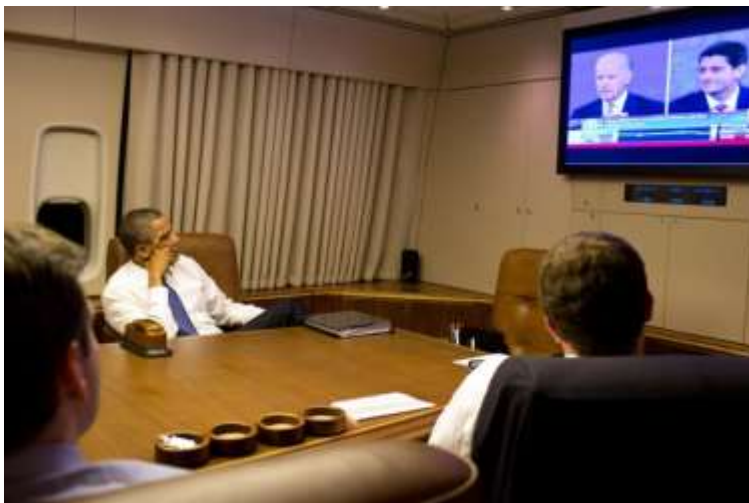
Aboard Air Force One, President Obama watches the Perception Analyzer data lines from CNN's coverage of the Vice Presidential Debate.